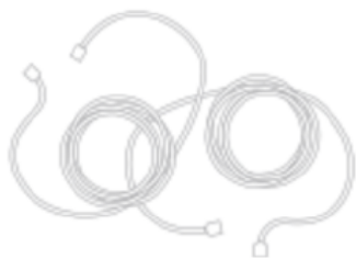
2 CAT6 Ethernet Cables

In addition to the MX450, the following are provided: