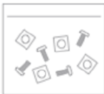
Rack Mounting Kit